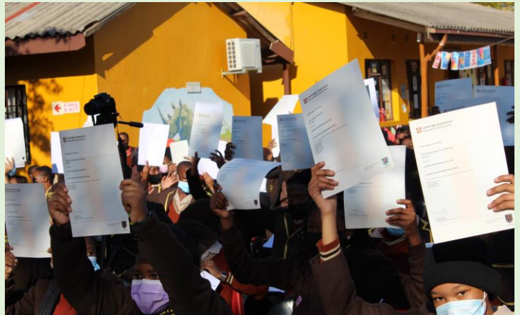
2021 Standard 7 ICT Graduates showing off their certificates