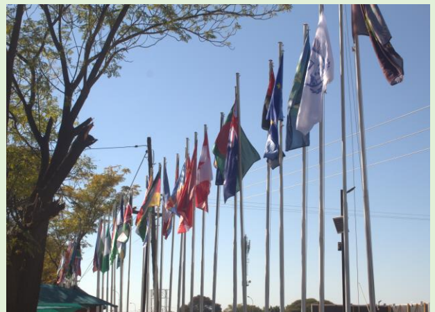
International flags flying high