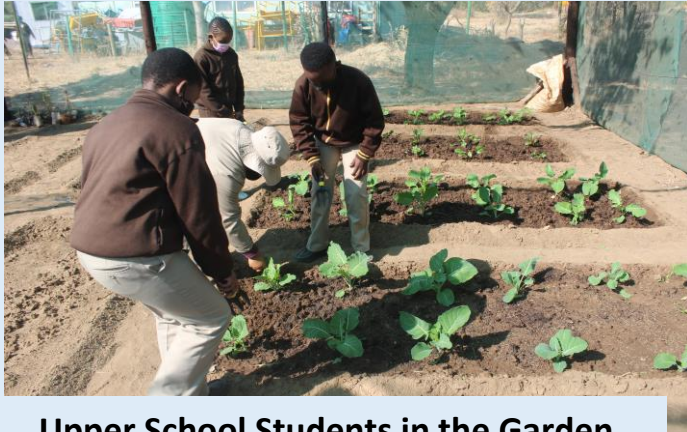
Upper School Students in the Garden

Currently, the following crops are planted: Spinach, Rape, beetroot and choumoellier. It is the hope of the school that children will be encouraged to start their own back yard vegetable gardening.